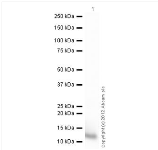
Western blot - Anti-Serum Amyloid A antibody [115] (ab6887)

Please note: All products are "FOR RESEARCH USE ONLY. NOT FOR USE IN DIAGNOSTIC PROCEDURES"