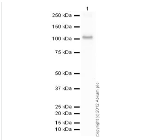
Western blot - Recombinant human PKC alpha protein (ab55672)

Please note: All products are "FOR RESEARCH USE ONLY. NOT FOR USE IN DIAGNOSTIC PROCEDURES"