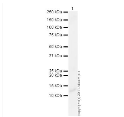
Western blot - Recombinant Human Parathyroid Hormone protein (ab51234)

Please note: All products are "FOR RESEARCH USE ONLY. NOT FOR USE IN DIAGNOSTIC PROCEDURES"