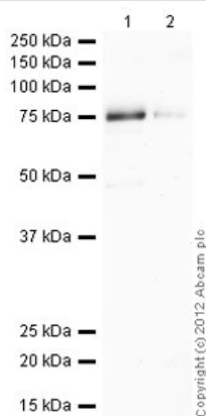
Western blot - Recombinant Human MK2 protein (ab79910)