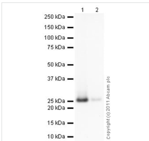
Western blot - Recombinant Human GSTA1 protein (ab95381)

15% SDS-PAGE image (3ug) generated using ab95381