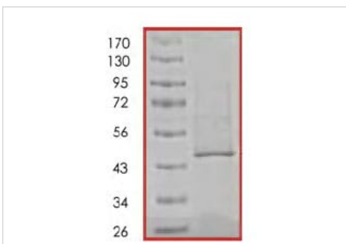
SDS-PAGE - Recombinant human FIST protein (ab85601)

The Specific activity of ab85601 was determined to be 48 nmol/min/mg.