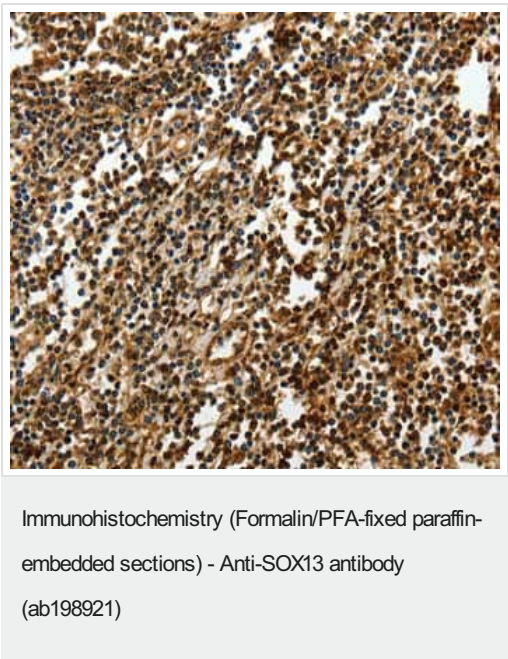
Immunohistochemical analysis of paraffin-embedded Human tonsil tissue labeling SOX13 with ab198921 at 1/50 dilution.