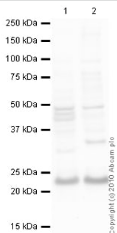
Western blot - Anti-RAB7 antibody (ab77993)

ab77993 at 10µg/ml staining RAB7 in human skeletal muscle tissue by Immunohistochemistry using formalin-fixed, paraffin-embedded tissue.