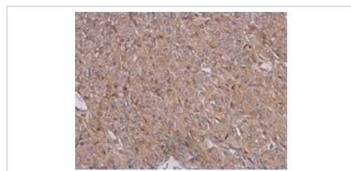
Immunohistochemistry (Formalin/PFA-fixed paraffin-embedded sections) - Anti-PCYT2 antibody (ab126142)

ab126142 at 1/500 dilution staining PCYT2 in Human Mahlavu (human hepatocellular carcinoma cell line) xenograft tissue by Immunohistochemistry.