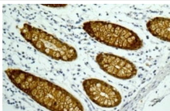
Immunohistochemistry (Formalin/PFA-fixed paraffin-embedded sections) - Anti-GAL4 antibody [EPR12710(B)] (ab175185)

Perform heat mediated antigen retrieval with citrate buffer pH 6 before commencing with IHC staining protocol.