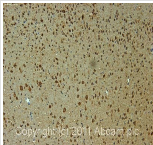
Immunohistochemistry (Formalin/PFA-fixed paraffin-embedded sections) - Anti-Chromogranin C/SGII antibody [SGII 6B1/3] (ab20245)

IHC image of ab20245 staining in normal rat brain formalin fixed paraffin embedded tissue section, performed on a Leica Bond™ system using the standard protocol F. The section was pre-treated using heat mediated antigen retrieval with sodium citrate buffer (pH6, epitope retrieval solution 1) for 20 mins. The section was then incubated with ab20245, 1 µg/ml, for 15 mins at room temperature and detected using an HRP conjugated compact polymer system. DAB was used as the chromogen. The section was then counterstained with haematoxylin and mounted with DPX.