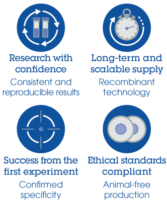
Anti-CD48 antibody [341] - BSA and Azide free (ab277141)

Please note: All products are "FOR RESEARCH USE ONLY. NOT FOR USE IN DIAGNOSTIC PROCEDURES"