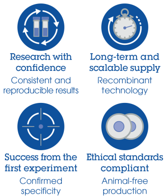
Anti-CCR3 antibody [Y31] - Low endotoxin, Azide free (ab228341)

Please note: All products are "FOR RESEARCH USE ONLY. NOT FOR USE IN DIAGNOSTIC PROCEDURES"