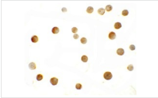
Immunocytochemistry of ZMYM2 in HeLa cells with ab106624 at 10 ug/mL.

Immunocytochemistry - Anti-ZMYM2 antibody (ab106624)