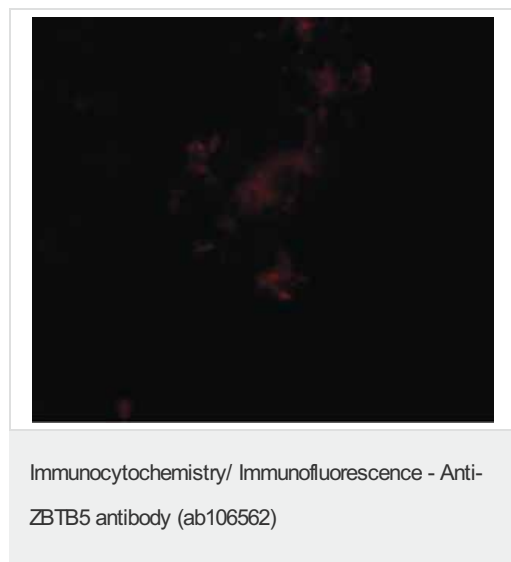
Immunofluorescence of ZBTB5 in Human brain tissue with ab106562 at 20 ug/mL.