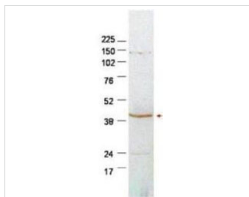
Western blot - Anti-SerpinB2 antibody (ab105739)

Anti-SerpinB2 antibody (ab105739) at 1/500 dilution + HeLa whole cell lysates at 50 µg