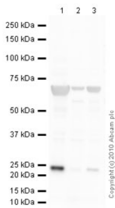
Western blot - Anti-LILRB1 antibody (ab77291)

All lanes : Anti-LILRB1 antibody (ab77291) at 1 µg/ml