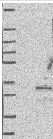
Western blot - Anti-C11orf70 antibody (ab122489)

ab122489, at 1/20 dilution, staining C11orf70 in formalin-fixed, paraffin-embedded Human cerebellum tissue.