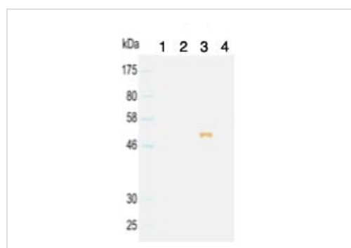
Western blot - Mouse monoclonal [KT98] Anti-Rat IgG2b H&L (HRP) (ab106750)

All lanes : Mouse monoclonal [KT98] Anti-Rat IgG2b H&L (HRP) (ab106750) at 1/1000 dilution