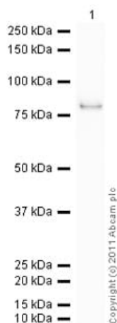
SDS-PAGE - Recombinant Human Smad1 protein (ab84653)

Ab46688 recognizes the tagged recombinant Smad1 protein (ab84653) which has an expected molecular weight of 83 kDa.