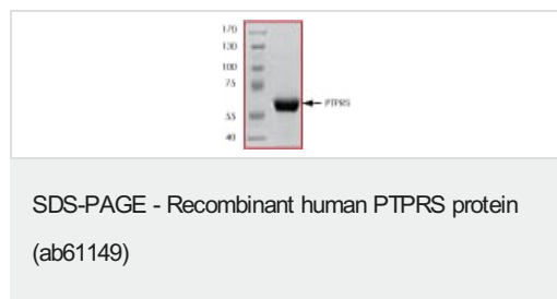
ab61149 on SDS-PAGE, MW ~63 kDa.

Please note: All products are "FOR RESEARCH USE ONLY. NOT FOR USE IN DIAGNOSTIC PROCEDURES"