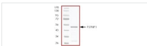
SDS-PAGE - Recombinant Human p27 KIP 1 protein (ab56279)

Standard curve for p27 KIP 1 (Analyte: ab56279); dilution range 1pg/ml to 1µg/ml using Capture Antibody Mouse monoclonal to p27 KIP 1 ( ab54563 ) at 1µg/ml and Detector Antibody Rabbit polyclonal to p27 KIP 1 ( ab7961 ) at 0.1µg/ml.