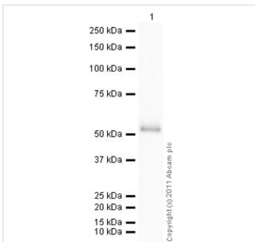
Western blot - Recombinant Human p27 KIP 1 protein (ab56279)

SDS-PAGE analysis of ab56279 with molecular weight markers. Approximate molecular weight 52kDa.