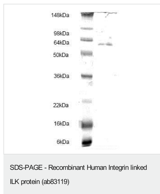
SDS-PAGE showing ab83119.