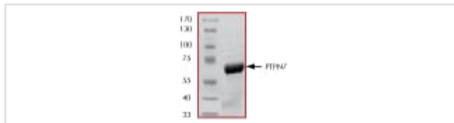
ab61136 on SDS-PAGE, MW ~67 kDa.

Functional Studies - Recombinant human HePTP / PTPN7 protein (ab61136)