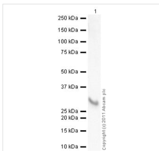
Western blot - Recombinant Human GST3 / GST pi protein (ab86703)

Please note: All products are "FOR RESEARCH USE ONLY. NOT FOR USE IN DIAGNOSTIC PROCEDURES"