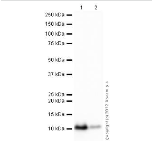
Western blot - Recombinant Human Glutaredoxin 1 protein (ab86987)