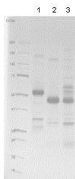
SDS-PAGE - Recombinant human CD40 protein (Fc Chimera Active) (ab83917)

1D SDS-PAGE of ab83917 before and after treatment with glycosidases to remove oligosaccharides.