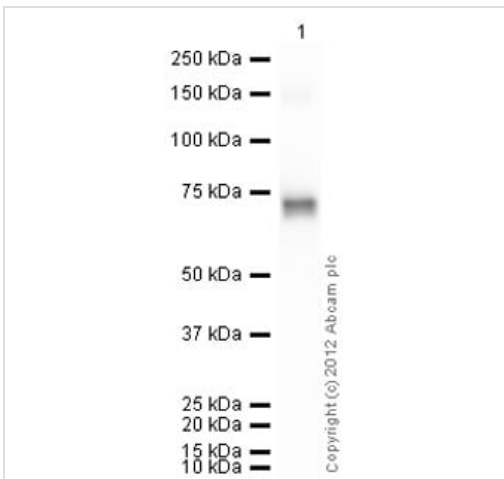
Western blot - Recombinant human CD105 protein (ab54338)

Standard Curve for CD105 (Analyte: CD105 protein (ab54338) ); dilution range 1pg/ml to 1ug/ml using Capture Antibody Mouse monoclonal [MEM-226] to CD105 (ab2529) at 5ug/ml and Detector Antibody Rabbit polyclonal to CD105 (ab21224) at 0.5ug/ml.