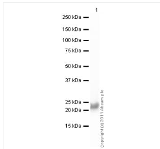
Western blot - Recombinant Human Alpha B Crystallin protein (ab48779)

Please note: All products are "FOR RESEARCH USE ONLY. NOT FOR USE IN DIAGNOSTIC PROCEDURES"