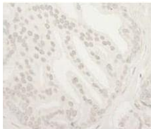
Immunohistochemistry (Formalin/PFA-fixed paraffin-embedded sections) - Anti-USP37 antibody (ab96244)

ab96244, at 1/250 dilution, staining USP37 in formalin-fixed, paraffin-embedded Human ovarian carcinoma by Immunohistochemistry using DAB detection. Epitope retrieval was performed.