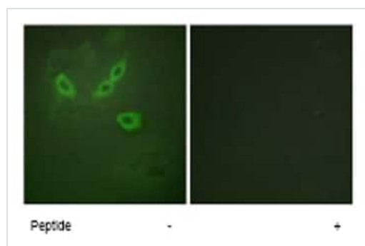
Immunocytochemistry/ Immunofluorescence - Anti-TUSC5 antibody (ab64803)

Immunofluorescence analysis of HeLa cells using ab64803 at a 1:500 dilution.