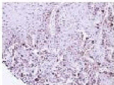
Immunohistochemistry (Formalin/PFA-fixed paraffin-embedded sections) - Anti-TACC2 antibody (ab96760)

Immunohistochemical analysis of TACC2 in paraffin embedded Cal27 xenograft, using ab96760 antibody at a 1/100 dilution.