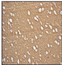
Immunohistochemistry (Formalin/PFA-fixed paraffin- embedded sections) - Anti-SYN2 antibody [EPR3277] (ab76494)

Immunohistochemical analysis of paraffin-embedded human brain tissue using 1/100 ab76494