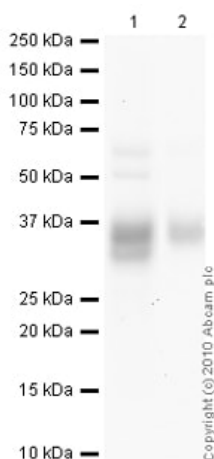
Western blot - Anti-Surfactant Protein A/PSAP antibody [6F10] (ab51891)

ab51891 staining sections of human lung at 1:3000 dilution. Immunoreactivity is seen with alveolar type II cells, nonciliated bronchial cells and a subset of alveolar macrophages.