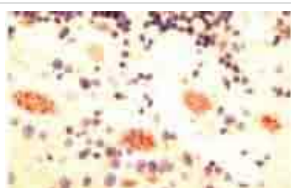
Immunohistochemistry (Formalin/PFA-fixed paraffin-embedded sections) - Anti-Scn1a antibody (ab24820)

Staining of human cerebellum with anti-sodium channel antibody. The tissue was boiled in 10mM citrate buffer, pH 6.0 for 10 mins followed by cooling at room temperature for 20 mins. The working dilution for the antibody is 1:200 for 30 min at room temperature.