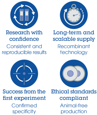
Anti-Mu Opioid Receptor antibody [UMB3] - Low endotoxin, Azide free (ab227067)

Please note: All products are "FOR RESEARCH USE ONLY. NOT FOR USE IN DIAGNOSTIC PROCEDURES"