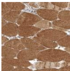
Immunocytochemistry/ Immunofluorescence - Anti-LRP5L antibody (ab122013)

ab122013, at a 1/10 dilution, staining Human LRP5L in skeletal muscle, using Immunohistochemistry, Formalin/PFA-fixed paraffin-embedded tissue. Moderate cytoplasmic positivity in myocytes shown.