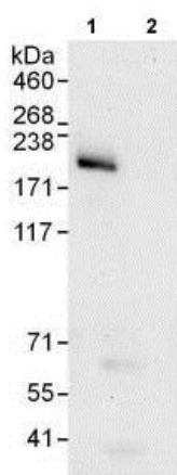
Immunoprecipitation - Anti-INO80 antibody (ab118787)

Detection of INO80 in Immunoprecipitates of Hela whole cell lysates (1 mg for IP, 20% of IP loaded) using ab118787 at 6 µg/mg lysate for IP (Lane 1) and at 1 µg/ml for subsequent Western blot detection. Lane 2 represents control IgG IP.