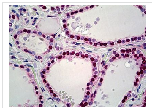
Human Thyroid, Formalin-Fixed, Paraffin-Embedded tissue, stained with ab117637 at 5µg/ml.

Immunohistochemistry (Formalin/PFA-fixed paraffin-embedded sections) - Anti-HMGN2 antibody (ab117637)