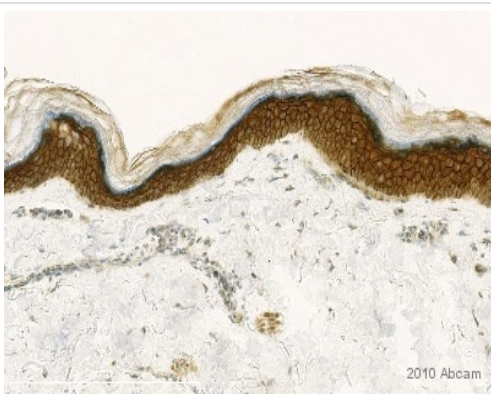
Immunohistochemistry (Formalin/PFA-fixed paraffin-embedded sections) - Anti-gamma Catenin antibody (ab15153)

Human breast carcinoma stained with anti gamma catenin antibody ab15153 (1/100 for 10 min at RT). Gamma catenin staining is seen on the cell membrane and in the cytoplasm.