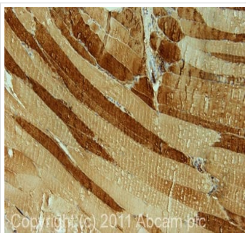
Immunohistochemistry (Formalin/PFA-fixed paraffin-embedded sections) - Anti-Fast Myosin Skeletal Heavy chain antibody (ab91506)

IHC image of Fast Myosin Skeletal Heavy chain staining in Mouse skeletal muscle FFPE section, performed on a Bond™ system using the standard protocol F. The section was pre-treated using heat mediated antigen retrieval with sodium citrate buffer (pH6, epitope retrieval solution 1) for 20 mins. The section was then incubated with ab91506, 1 µg/ml, for 15 mins at room temperature and detected using an HRP conjugated compact polymer system. DAB was used as the chromogen. The section was then counterstained with haematoxylin and mounted with DPX