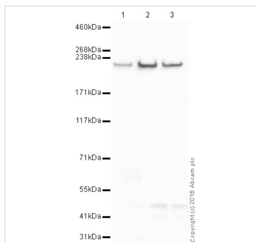
Western blot - Anti-Fast Myosin Skeletal Heavy chain antibody (ab91506)

All lanes : Anti-Fast Myosin Skeletal Heavy chain antibody (ab91506) at 1 µg/ml