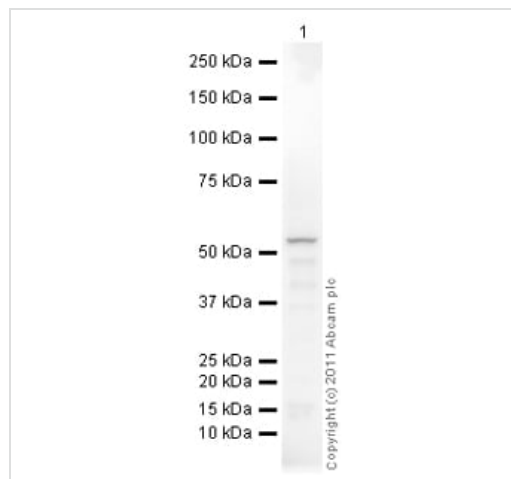
Western blot - Anti-DGAT1 antibody (ab100982)

Anti-DGAT1 antibody (ab100982) at 1 µg/ml + Caco 2 (Human colonic carcinoma cell line) Whole Cell Lysate at 10 µg