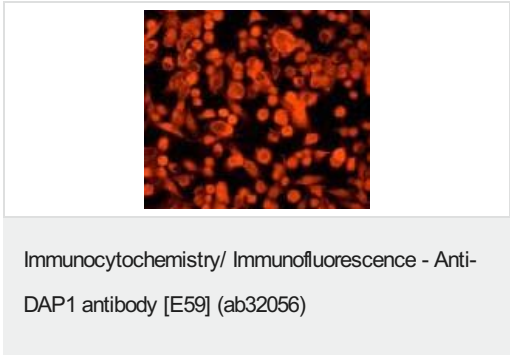
Immunofluorescent analysis of DAP1 expression in HeLa cells using 1/250 ab32056.

機能 Involved in mediating interferon-gamma-induced cell death.