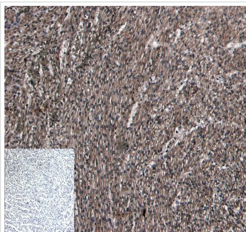
Immunohistochemistry (Formalin/PFA-fixed paraffin-embedded sections) - Anti-beta 1 Adrenergic Receptor antibody (ab77189)

Immunohistochemistry (Formalin/PFA-fixed paraffin-embedded sections) analysis of human heart tissue labelling beta 1 Adrenergic Receptor with ab77189 at 6 µg/mL. Heat mediated antigen retrieval was performed with citrate buffer pH 6. HRP-staining.