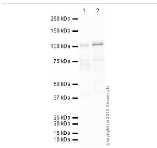
Western blot - Anti-alpha Adducin antibody (ab101002)

For other IHC staining systems (automated and non-automated) customers should optimize variable parameters such as antigen retrieval conditions, primary antibody concentration and antibody incubation times.