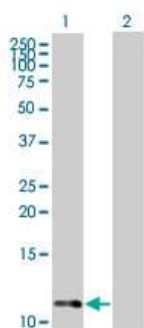
Western blot - RPA14/RPA3 overexpression 293T lysate (whole cell) (ab94054)

ab94054 at 15 µg/lane on an SDS-PAGE gel.