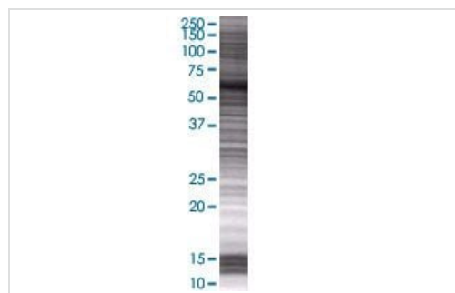
SDS-PAGE - RAD18 overexpression 293T lysate (whole cell) (ab94312)