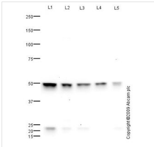
Western blot - Anti-FOXC2 antibody (ab65141)

All lanes : Anti-FOXC2 antibody (ab65141) at 1 µg/ml