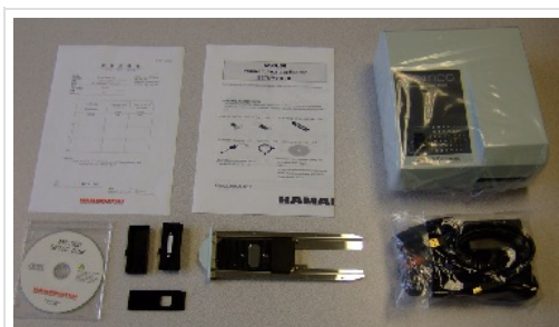
Other - Dipstick Reader (ab117066)