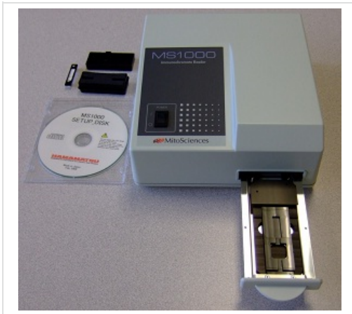
Other - Dipstick Reader (ab117066)