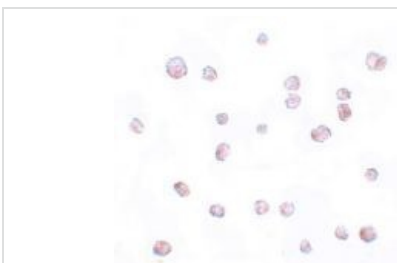
Immunocytochemistry - SCRN2 antibody (ab105356)

ab105356, at 20 µg/ml, staining SCRN2 in 293 cells by immunocytochemistry.